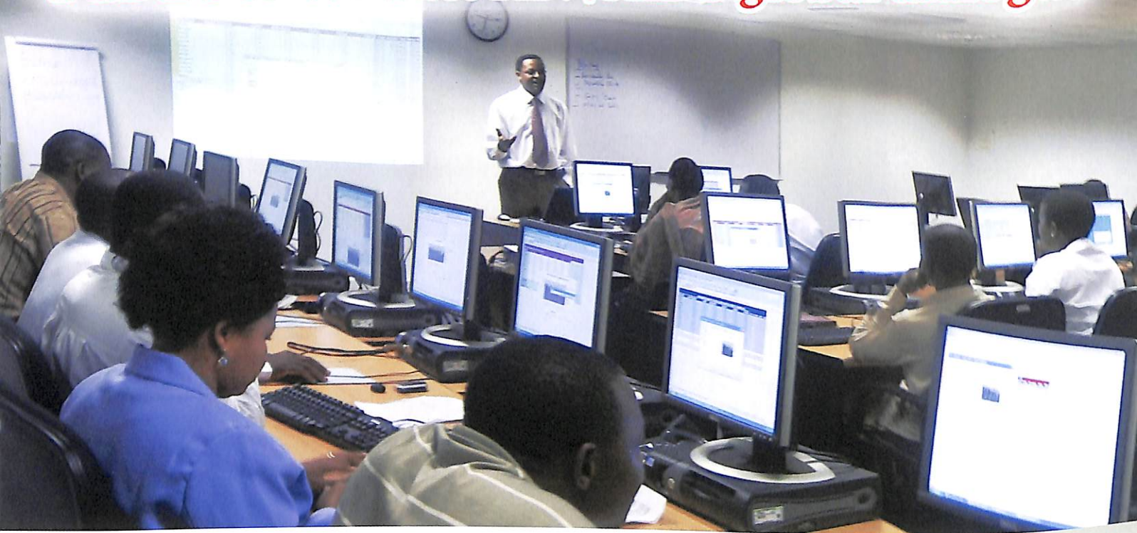
A Videoconference in session

The Tanzania Global Development Learning Centre (TGDLC) in collaboration with the World Bank Institute (WBI) will on June 20, 2006 direct a global dialogue on youth and HIV/AIDS at the Institute of Finance Management (IFM).