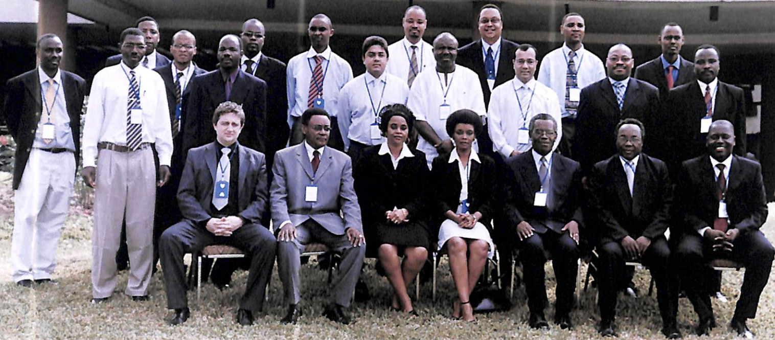
Corporate Governance workshop participants pose for a group photo