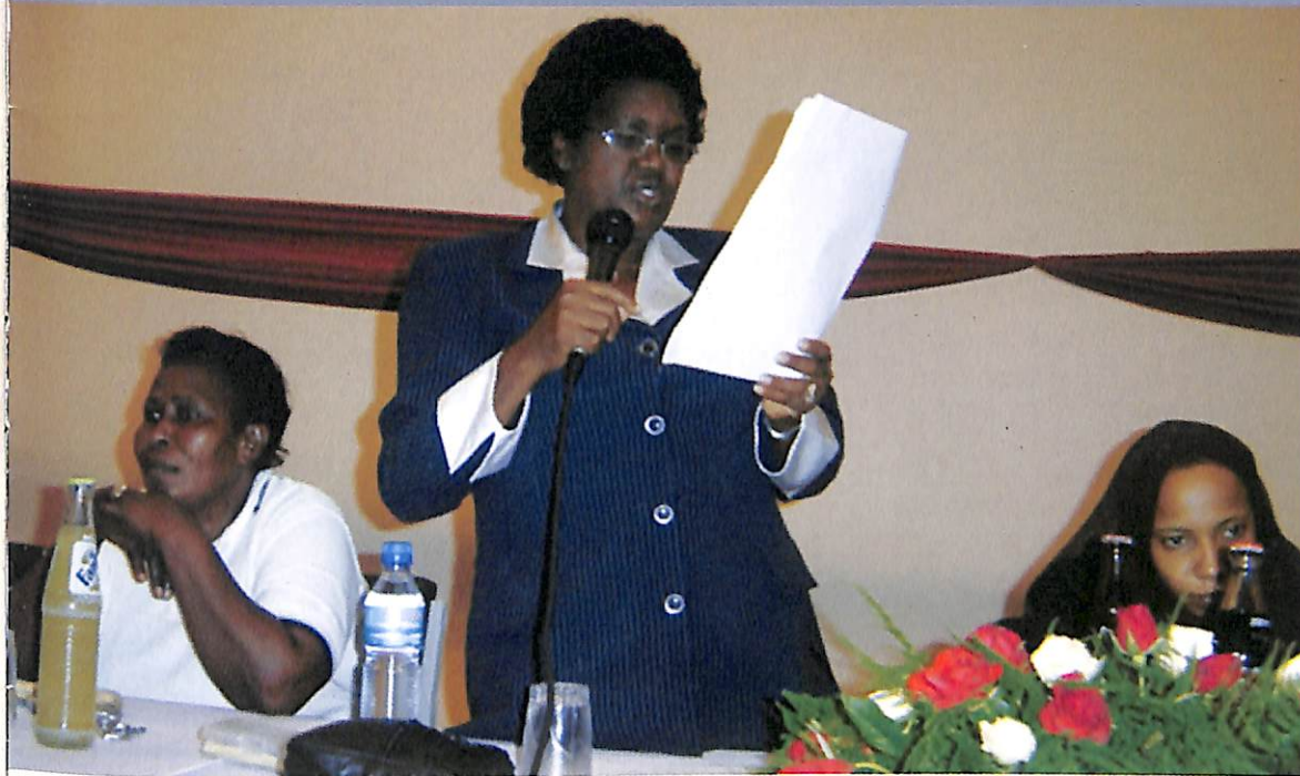
Director of Personnel and Administration officiates at IFM-SO Women's Day