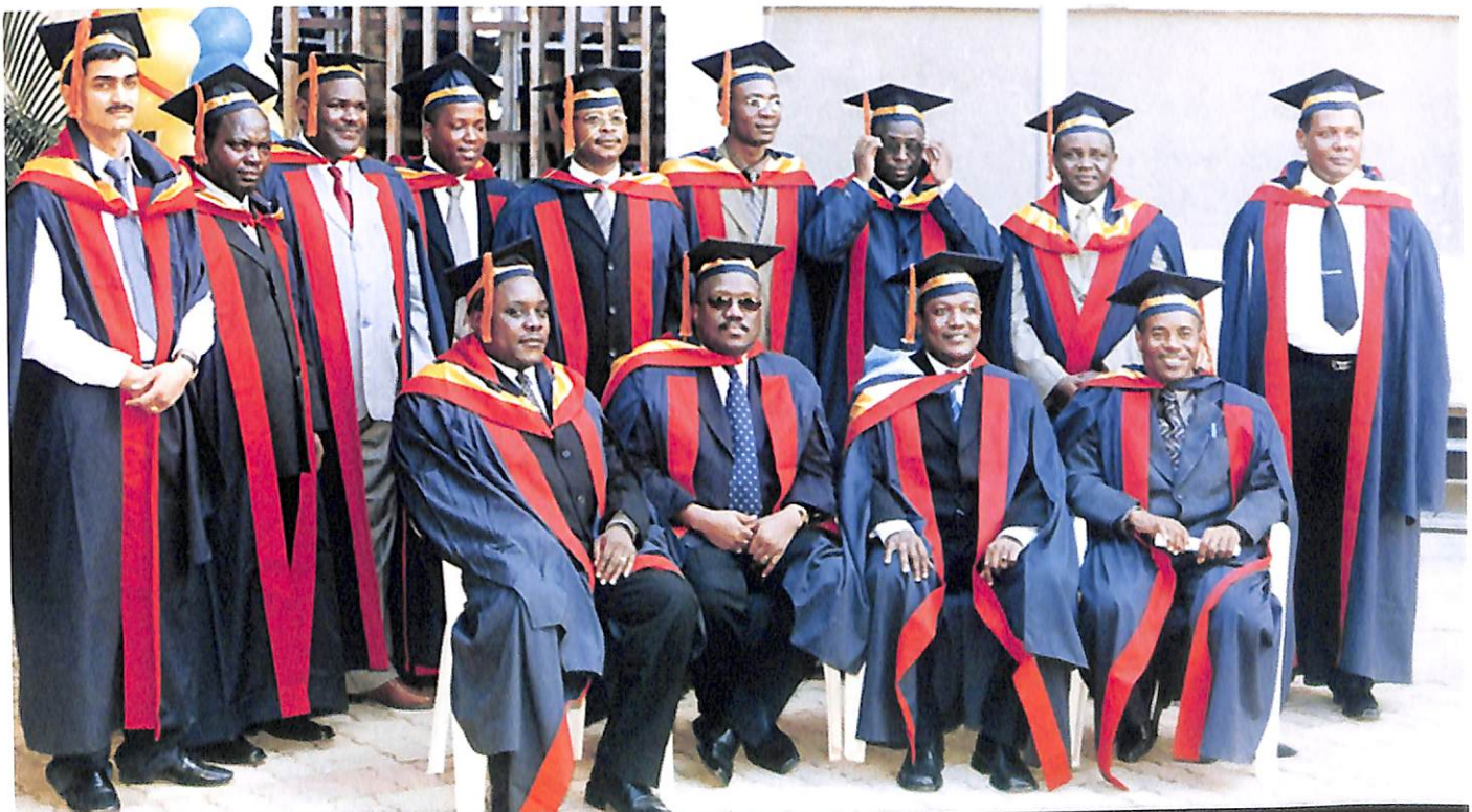
A cross section of MBA International Business Graduands on March 14, 2006.

The Director urged the MBA graduates to make use of the skills they had acquired in the MBA programme for the betterment of Tanzanians.