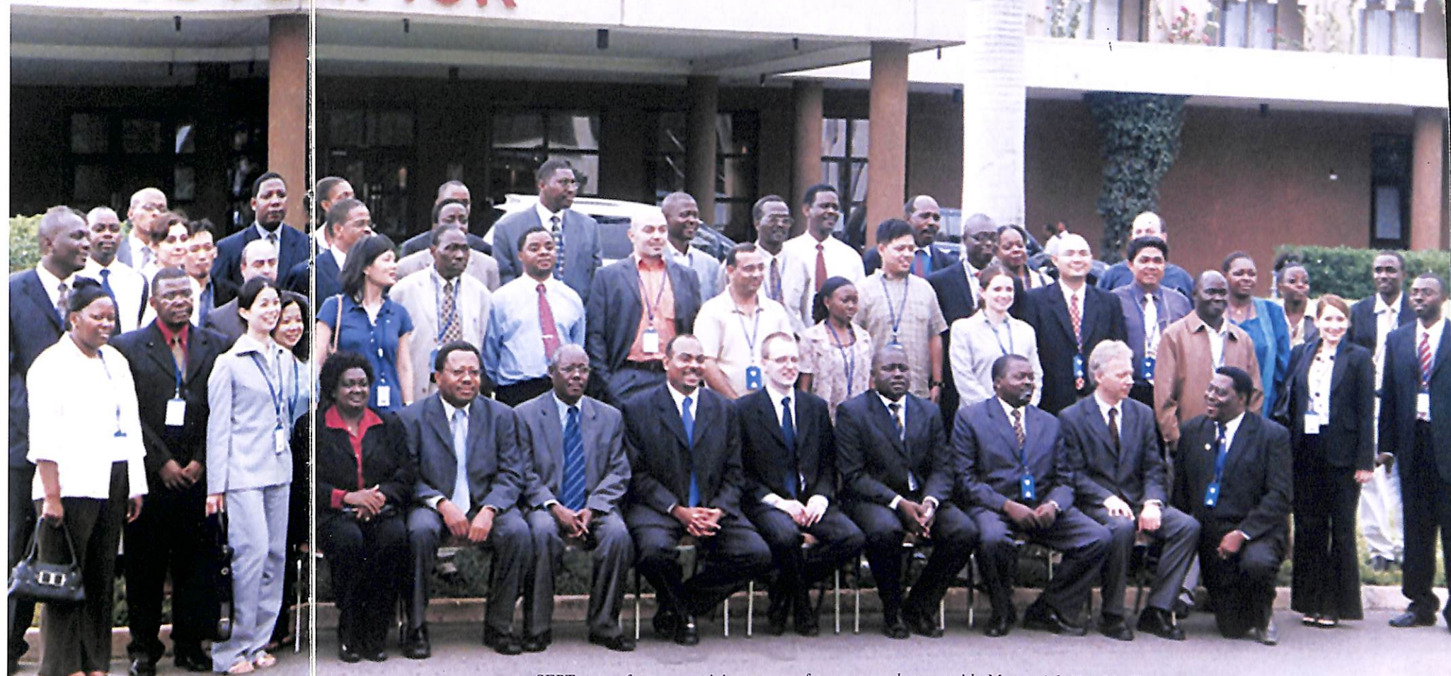
SEPTnet conference participants pose for a group photo outside Movenpick Hotel in Dar es Salaam.