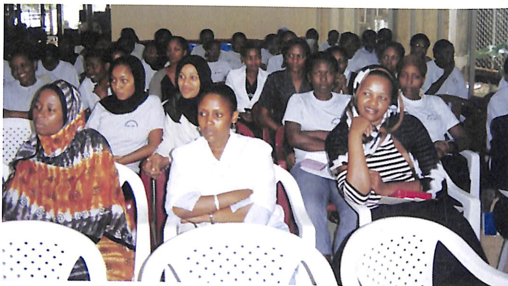
A cross section of IFM-SO Women's Day conference participants

Commenting on the fight against HIV/AIDS, she said, "Our investment in education would become a waste if