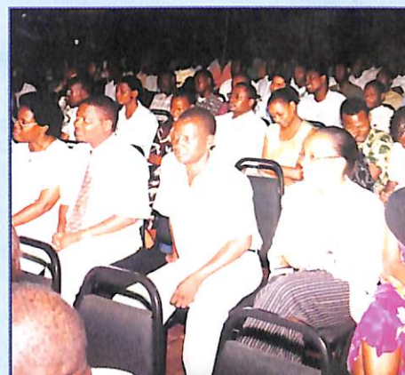
Part of the IFM Community members listening attentively to the Minister's address